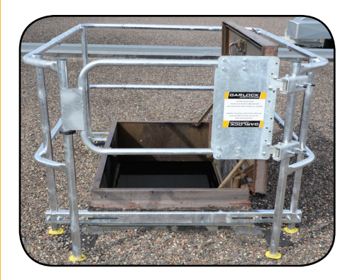
Self-closing Gate prevents accidental entry.