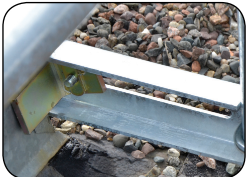
Unique compression fit design. No Drilling!