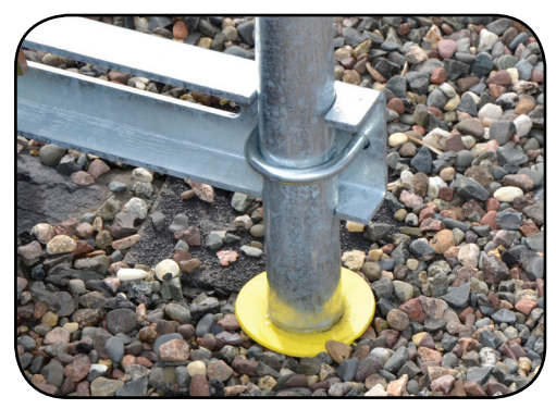
Rail pads protect roof surface.