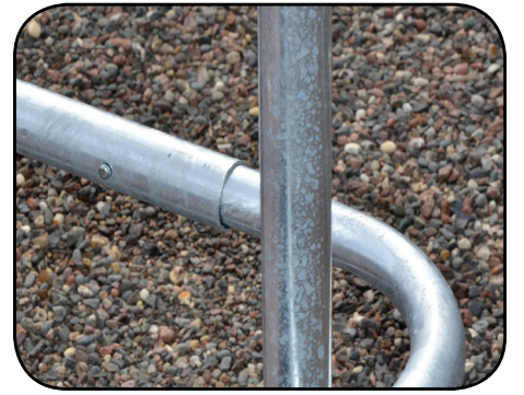
Rails simply snap together for quick, easy assembly.