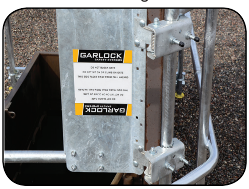
Rugged hinges allow gate tension adjustment.